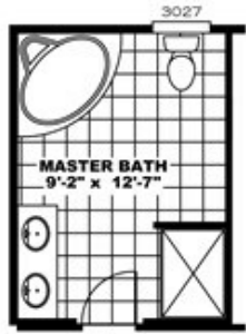
OPT. GLAMOUR BATH